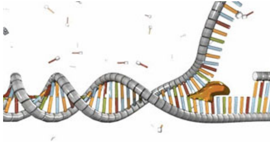
Figure 3: An artist's impression of Helicase unwinding a DNA strand.